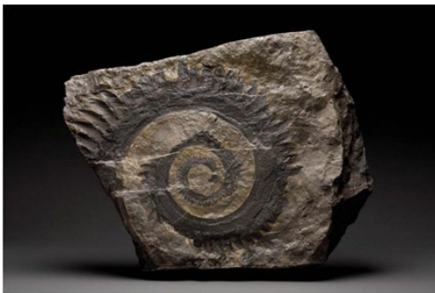
Figure 4. Chip Clark, Fossil tooth whorl of ancient shark . 2018, Digital Image. Reproduced from: Smithsonian Institution. Copyright 2018 by Chip Clark/Smithsonian Institution.