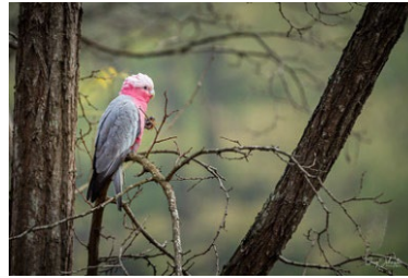
Figure 1. Galah

If you are reproducing a photograph, illustration, or other complete work, acknowledge the copyright status in a list of figures presented at the end of your presentation (preceding the reference list). Provide: