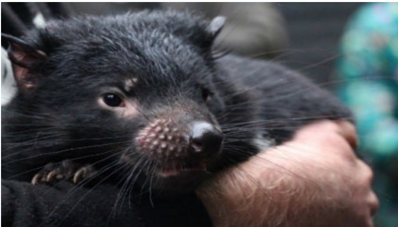
Figure 2. Sleepy tasmanian devil in the rain