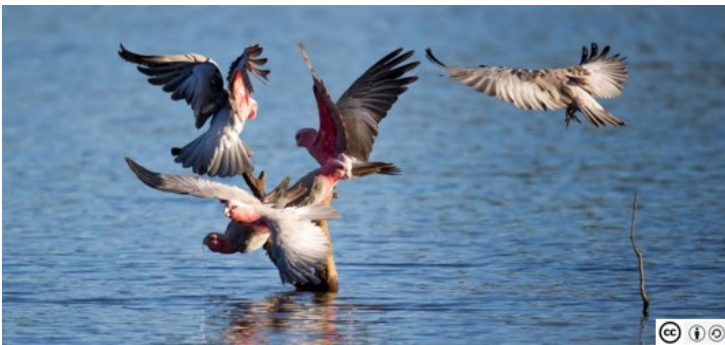
Figure 3. Jim Bendon, Galah 2 . 2014, Digital Image. Reproduced from: Flickr. CC BY-SA 2.0.