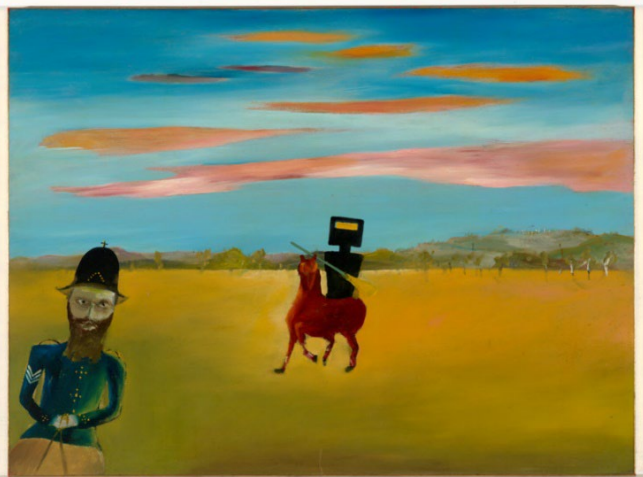
Figure 5. Sydney Nolan, The encounter . 1946, Enamel paint on composition board, 90.4 x 121.2 cm. Canberra: National Gallery of Australia.